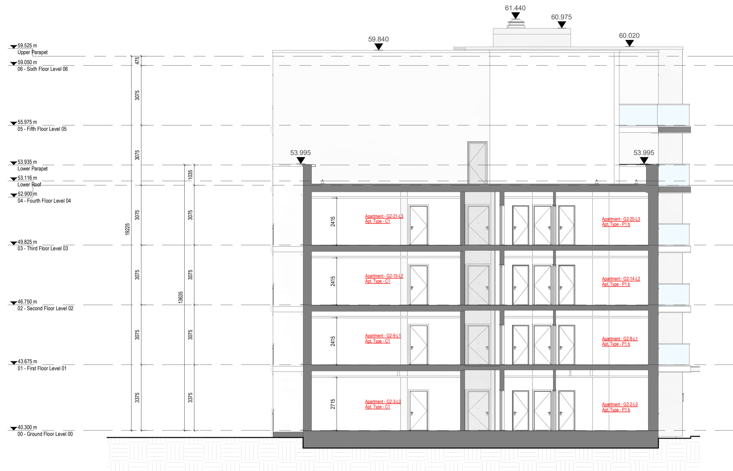
1 GA - Section BB 1 : 100